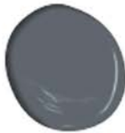
Benjamin Moore Ocean Floor - 1630 A dark, steel blue gray.