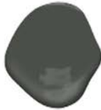
Benjamin Moore Deep River - 1582 A modern, dark gray color option with blue undertones.