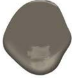
Benjamin Moore Deep Creek - 1477 A subtle and versatile green-gray.