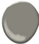
Benjamin Moore Chelsea Gray - HC-168 A medium, scholarly gray with brownish and violet undertones.